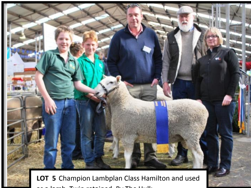
LOT 5 Champion Lambplan Class Hamilton and used as a lamb. Twin retained. By The Hulk