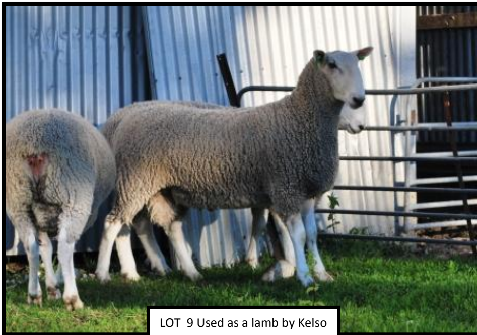
LOT 9 Used as a lamb by Kelso