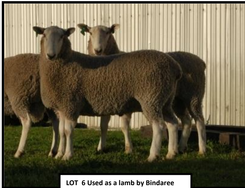
LOT 6 Used as a lamb by Bindaree