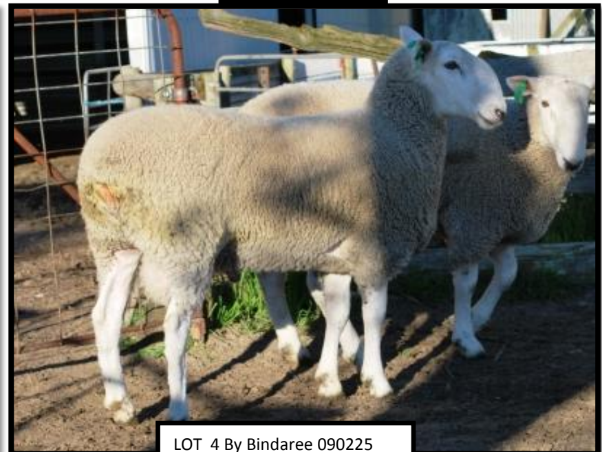
LOT 4 By Bindaree 090225