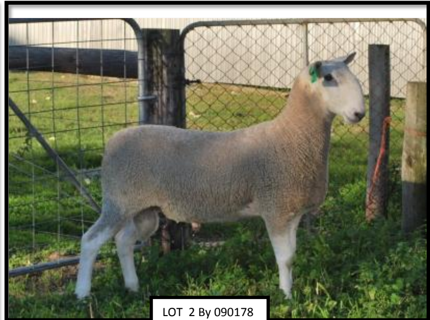
LOT 2 By 090178