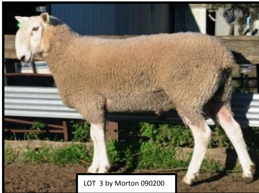
LOT 3 by Morton 090200