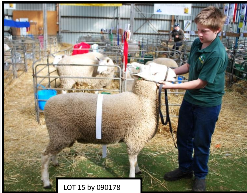
LOT 15 by 090178