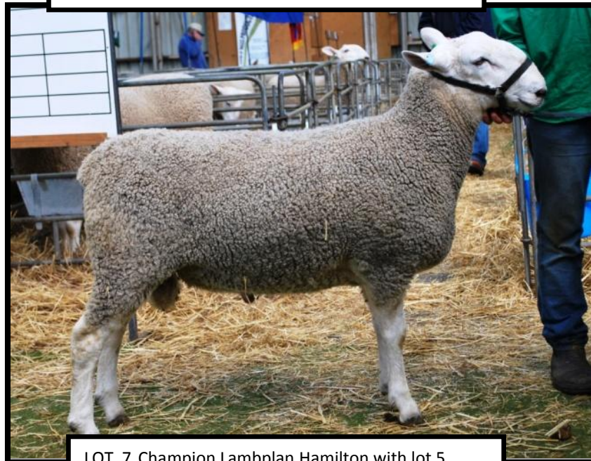
LOT 7 Champion Lambplan Hamilton with lot 5. Semen retained and used as a lamb by The hulk