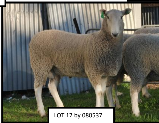
LOT 17 by 080537