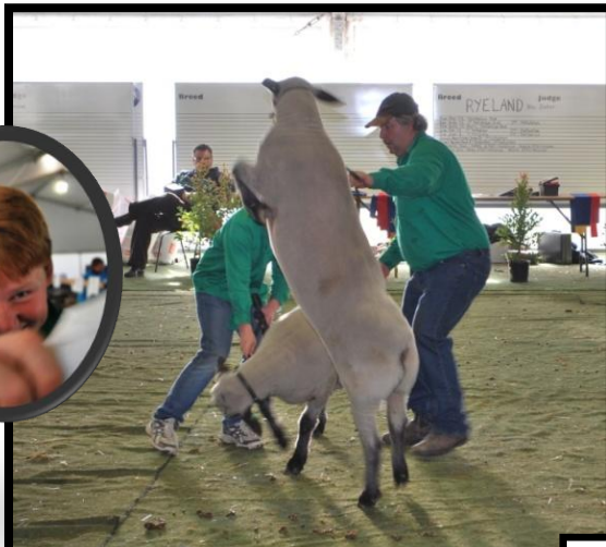
Calm before the storm, showing can be very entertaining