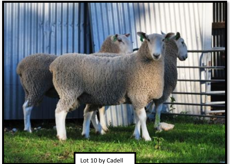
Lot 10 by Cadell