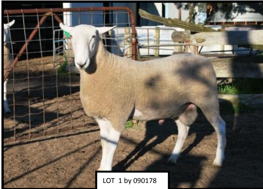
LOT 1 by 090178