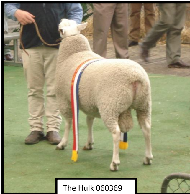
The Hulk 060369