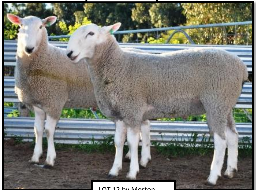
LOT 12 by Morton