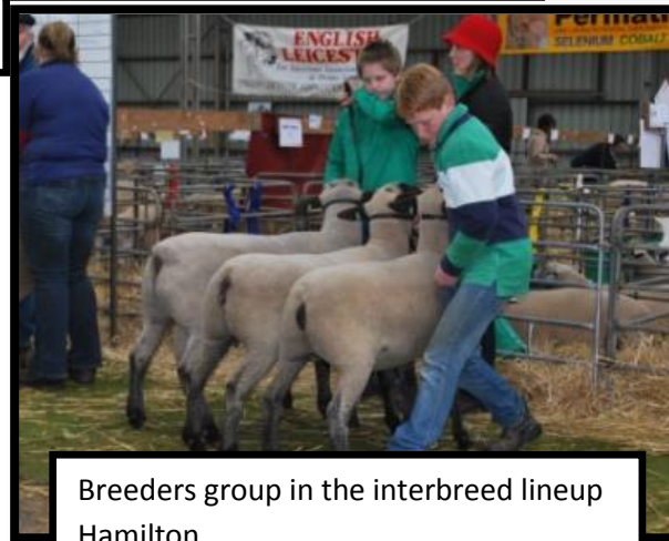
Breeders group in the interbreed lineup Hamilton