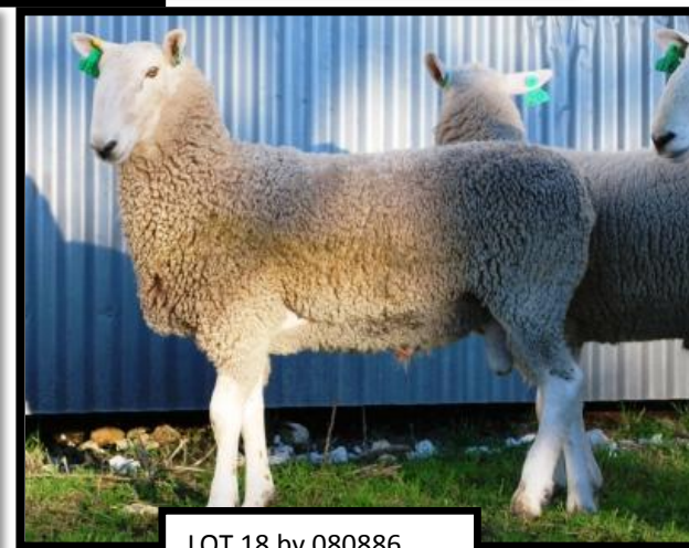
LOT 18 by 080886