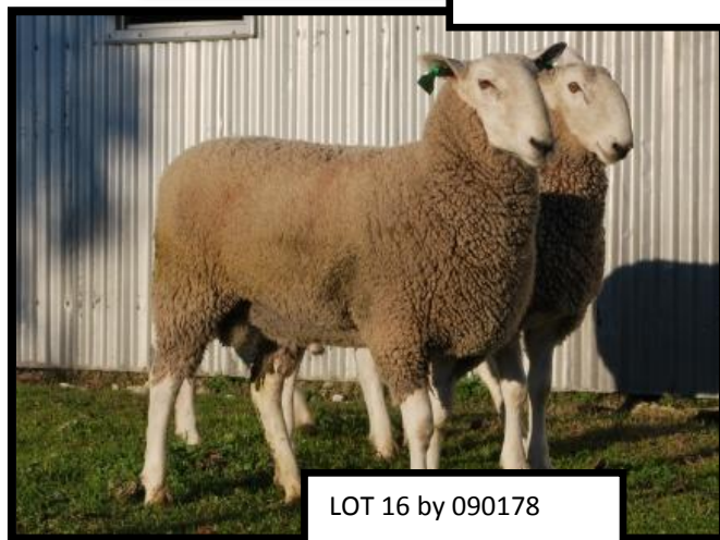
LOT 16 by 090178