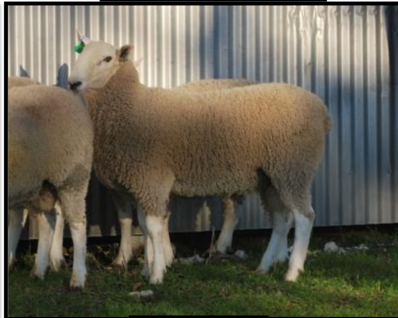
LOT 8 Twin to lot 7