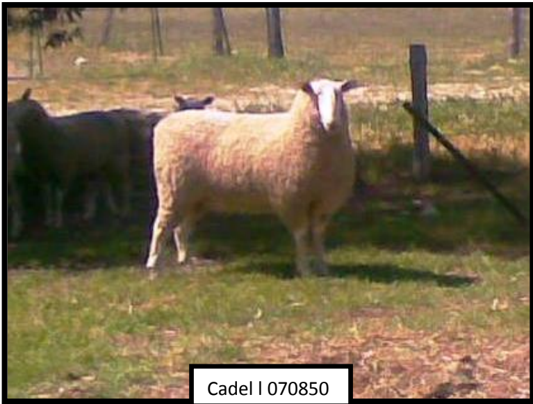
Cadel I 070850