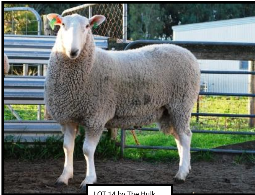
LOT 14 by The Hulk