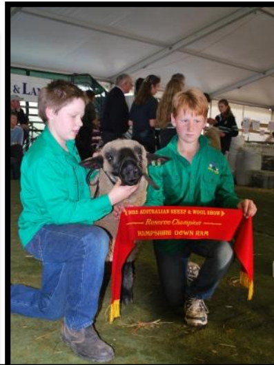
Reserve Champion Bendigo Lot 152